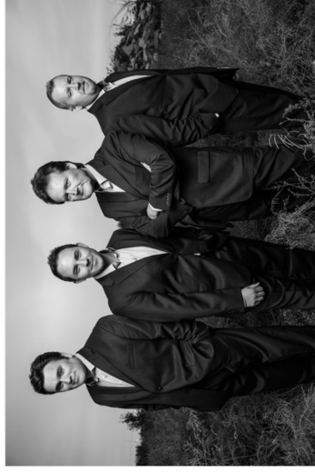
Blackwood Quartet Sunday, August 6 @ 6pm FBCO